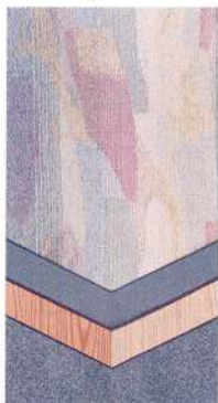
Juniper with Waterford Oak or Mystic Oak