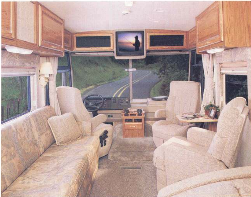
32T As you can see, there's plenty of room to relax in the lounge with the available Mobile Theater Sound System, overhead TV or VCR. Or use the fold-up table behind the passenger's chair for a game of chess. Driving the Adventurer is made easier with a bus-styled front design that provides a better field of vision. A tint band on the windshield helps lessen the sun's glare.