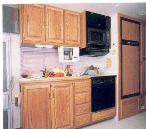
35C An inline galley with toe kicks under the cabinets puts every kitchen item within easy reach.