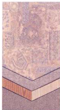
Sunshowers with Waterford Oak or Mystic Oak