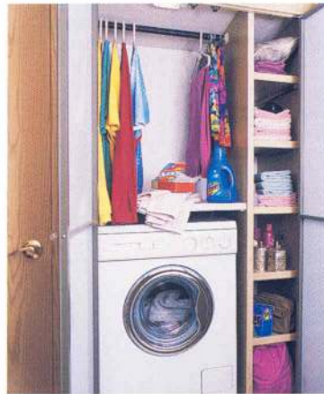
37G For added convenience during extended travel, a vented washer/dryer is available in this model, complete with clothes rod and multiple shelving.