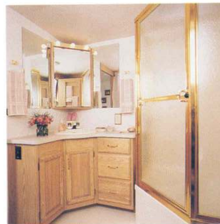
37G This roomy bathroom offers a corner sink, makeup lights, a glass shower door and abundant storage.