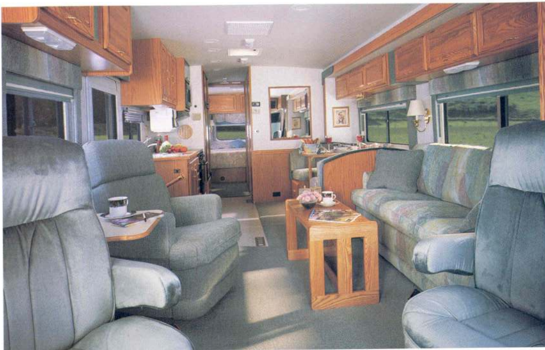
35C Watch your living and galley area grow with the StoreMore™ Hydraulic Slideout System, made even more comfortable in most models by an incliner lounge chair. Deep, full-length cabinets over the couch and dinette as well as slideout drawers under the dinette maximize your storage space.

Cross the threshold of this year's Adventurer and you'll be wowed as you surround yourself with comfort. In the galley you'll find beautifully constructed cabinets, a three-burner range and an available microwave/convection oven. You'll also notice that most Adventurer models include the PowerLine™ Energy Management System which monitors electrical usage and automatically cycles appliances off if power demands exceed available power. Several floorplans incorporate the exclusive StoreMore™ Hydraulic Slideout System which offers an expansive storage compartment that slides out with the room extension for easier access without sacrificing storage space. Every model is a full, widebody basement design with heated storage compartments. And for dirty clothes, the 37G offers an available vented washer/dryer tucked away by the bath area. What's more, everything is held secure with a Tri/Mark KeyOne™ System, so only one key is needed for most doors. In fact, about the only thing that can improve life in the Adventurer is the kind of view you give yourself when you park it.