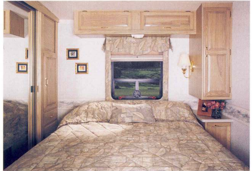
37G You just might have your most perfect sleep ever in this queen bedroom. It includes a Serta® Comfort Master Luxury innerspring mattress, full-length sliding mirrored doors, tip-out hamper, a bed that lifts for access to storage beneath it and a tip-out window to help keep the rain out and let a cool breeze in.