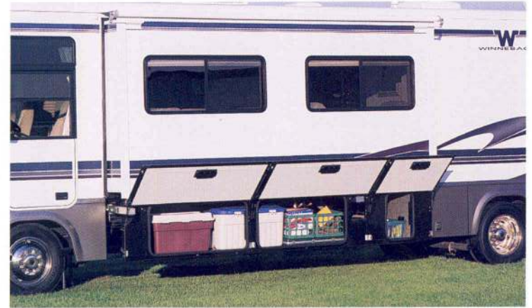
37G The StoreMore™ Hydraulic Slideout System gives you extra living space without sacrificing storage space. The generously sized compartments move with the room itself, offering easy access to stored gear.