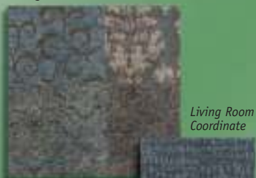
Living Room Coordinate