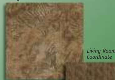
Living Room Coordinate