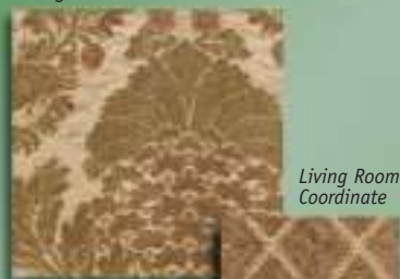
Living Room Coordinate