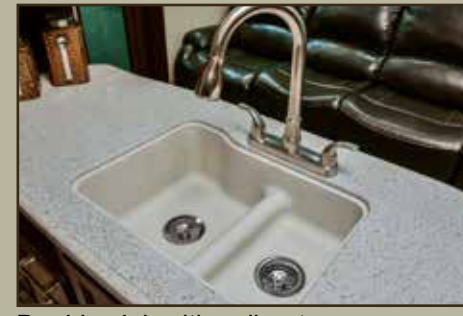
Double sink with pull-out sprayer