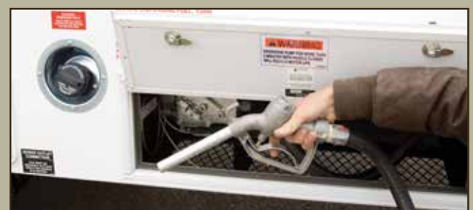
30 GALLONS OF FUEL ON THE GO

TORQUE owners Enjoy Safely Transporting Fuel in a Fuel Cell rather than having several 5 gallon fuel cans that take up floor space and can spill if not secured properly. A convenient filling hose and valve handle like you would find at the gas station for filling your toys and the Static Line (Metallic cable and clip that connects the toy and trailer together) that reduces the risk of static electricity sparks that are known to cause explosions!