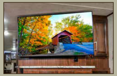
55" HD 4K LED TV in most models.