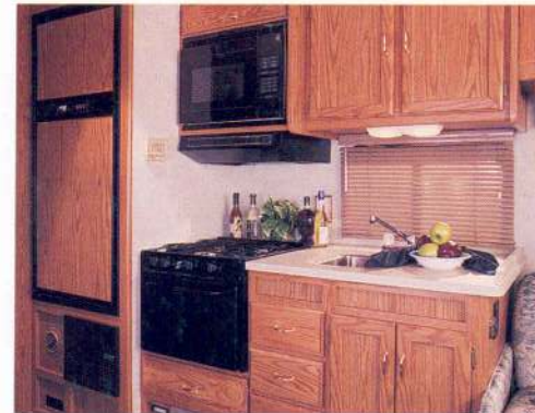
31WQ This in-line galley puts everything within easy reach. A durable sink cover can double as a cutting board to add valuable counter space, and a three burner range with a high output burner makes cooking a snap.