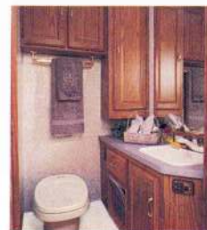
26WU This bathroom features a linen cabinet, pleated fabric shower door and a space saving towel bar over the toilet. There's also a frosty white skylight to let in as much natural light as the weather permits.