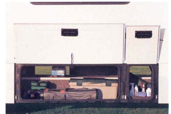
32WQ This all new basement design offers versatile storage compartments for holding plenty of gear. Fully-hinged and insulated beltline compartment doors, with single-paddle latches make packing a breeze.