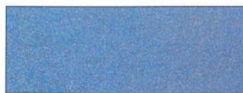
Cool Blue Brave DL

Exterior lower valance colors for the Brave DL are Light Silver, suggested with Village Green; and Cool Blue, suggested with Barcelona. However, you may order either valance color regardless of your Brave DL interior choice. For the Brave, Light Silver is the lower valance color offered.