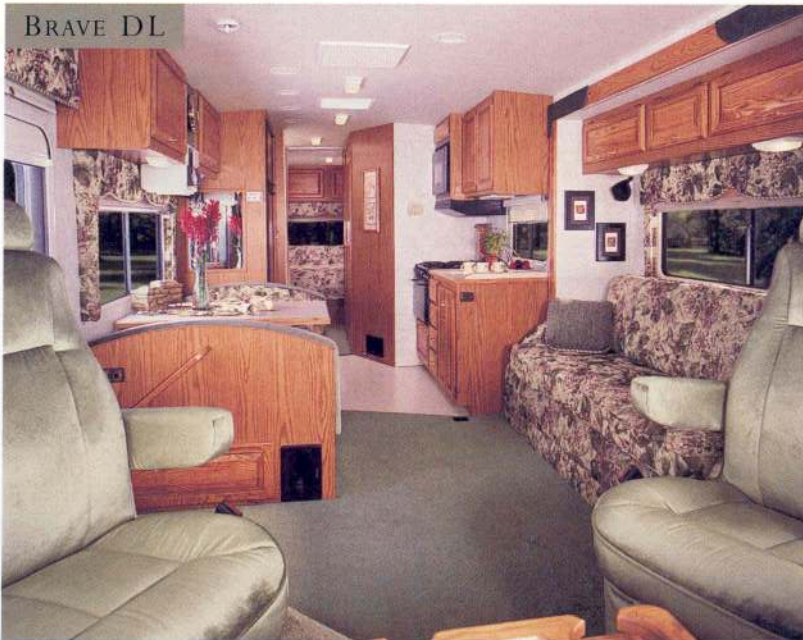
33DQ Watch your living area grow with this lounge slideout. Even the galley area feels larger when the room is extended. The bathroom on this unit includes make-up lights, a linen cabinet and space saving features like a recessed towel rack.