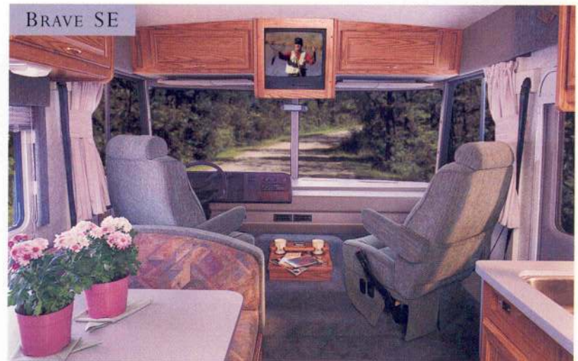
26WU This unit features an available overhead entertainment center with an available VCR, and swiveling captain's chairs that come in handy when you're relaxing with friends. The comfortable dinette seats four, and converts into additional sleeping space.