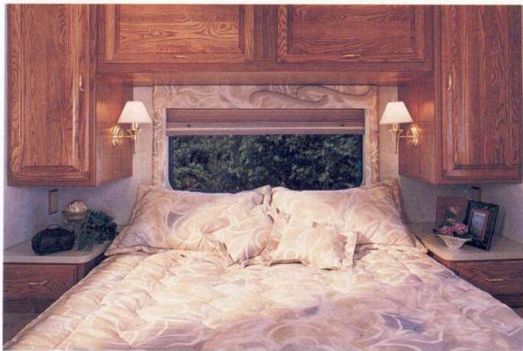
31DQ Snooze in style with the upgraded bedroom decor on this unit. The window treatments and throw pillows are just a few of the extras that will make you feel at home in the queen bed.