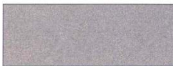
Light Silver Brave DL, Brave