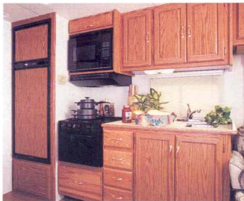
34WA This in-line galley puts all your kitchen supplies at arm's length and features a deep stainless steel sink with dual covers to maximize counter space.