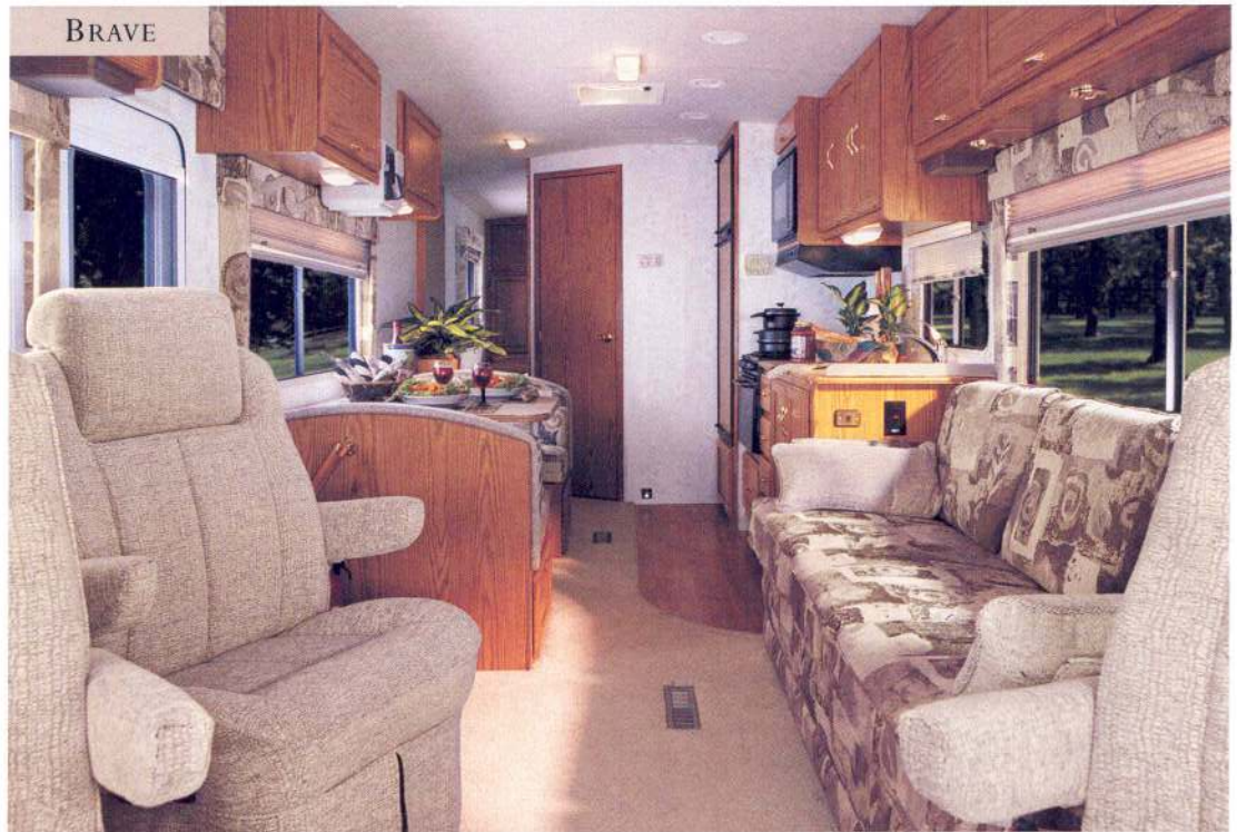
34WA This widebody basement model offers a popular side aisle floorplan that clearly separates the bedroom from the rest of the coach. An available coffeemaker is conveniently located above the dinette.

When people refer to the 1998 Brave series as tremendous, we're not sure if they're talking about the units themselves or their generous living and storage areas. Or both. This year, choose from three inviting lines within the series. Our entry level Brave SE offers luxuries like basement storage and generous compartments. The Brave DL offers basement storage and impressive upgrade features like raised panel wood doors, standard driver's door, a water purification system and an available Mobile Theater Sound System. And the Brave boasts a full basement design with pass through storage and a slideout room on the 35WP. The Brave series is built to last with benefits like a one piece fiberglass roof with ducted air conditioning, Thermo-Panel® sidewall construction and belt-line exterior compartment doors featuring single handle paddle latches. One of our numerous value-packed Brave series is sure to jump start your travel bug.