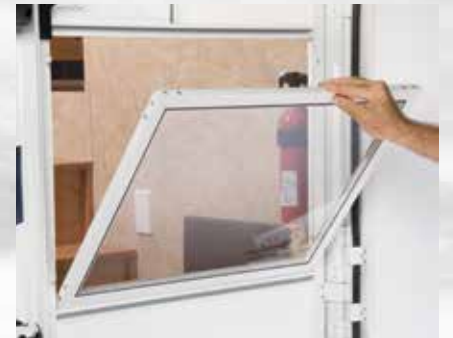
Removable "Soft Top" vinyl storm doors allow light and visibility without losing cooling or heating.