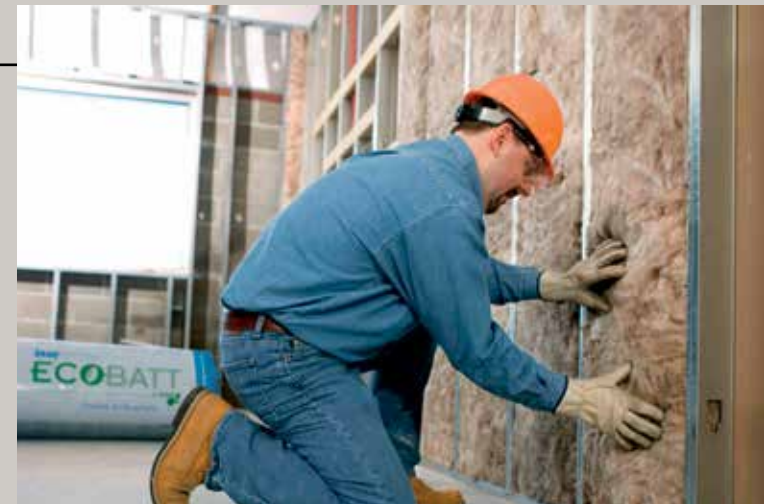
Residential, glasswool insulation designed by nature.