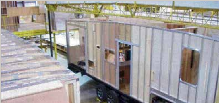
Aluminum studded sidewalls and roof trusses on 16" centers or less.