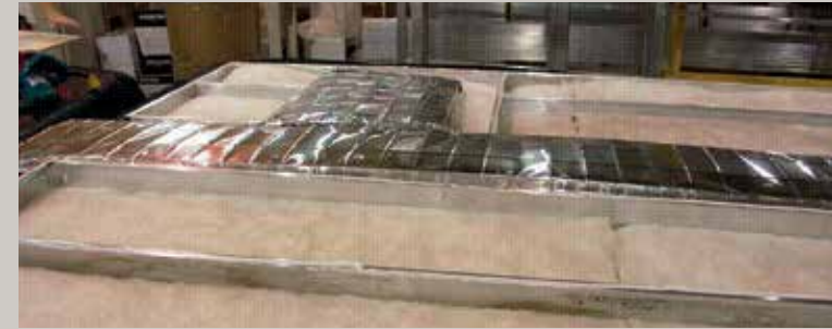
2" x 3" Aluminum floor studs