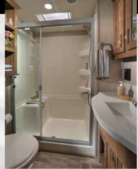
Silverback's luxurious bath includes a large 48" shower with seat and glass doors, porcelain toilet, and a Create-a-Breeze fan.