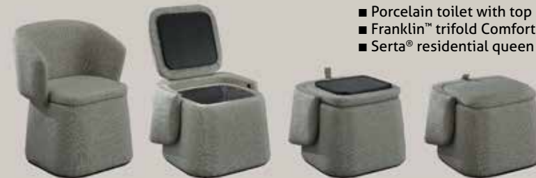
OPTIONAL MULTI-FUNCTION CHOTTOMAN

Is it an ottoman or a chair? You decide.