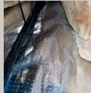
R-38 Radiant shield Thermo-foil wrap through ceilings, underbellies and under front cap.