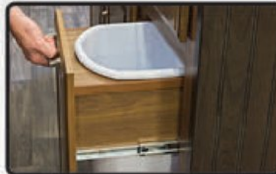
PULL OUT KITCHEN TRASH CAN STORAGE (SELECT MODELS)