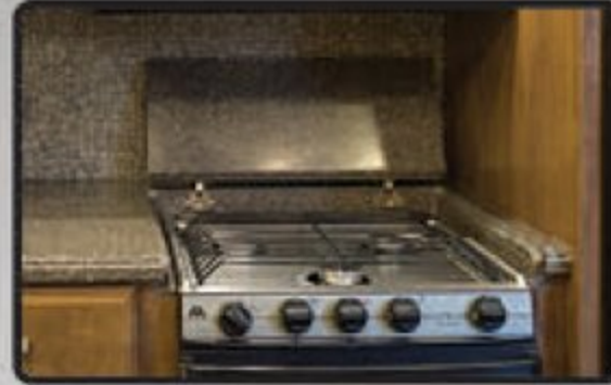
SOLID SURFACE HINGED RANGE COVER