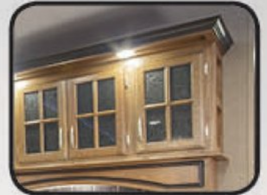
HARDWOOD CHERRY CABINET FRAMING (STILES)