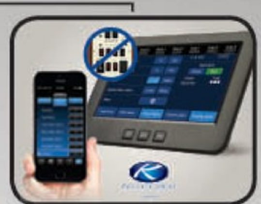
IN-COMMAND CONTROL SYSTEMS