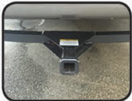
REAR ACCESSORY HITCH