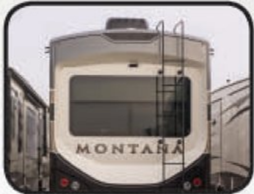
DECORATIVE FIBERGLASS REAR CAP (N/A 3790, 3791)