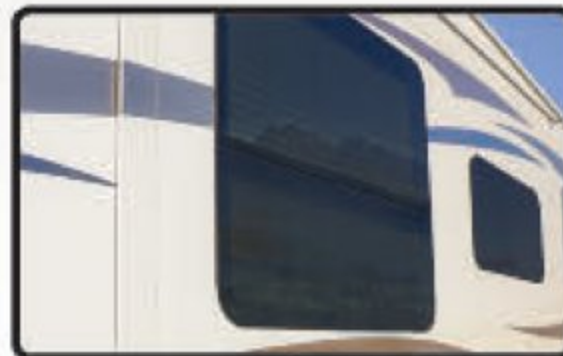
UPGRADE FRAMELESS WINDOWS