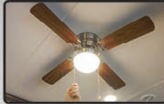
CEILING FAN WITH LIGHT KIT