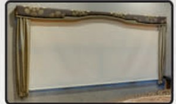
UPGRADE BLACKOUT ROLLER SHADES THROUGHOUT