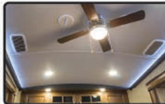
DUAL 15K QUIET COOL AIR CONDITIONING SYSTEM