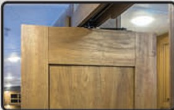
CLEVER SPACE SAVING PIVOT HINGE BATH DOOR