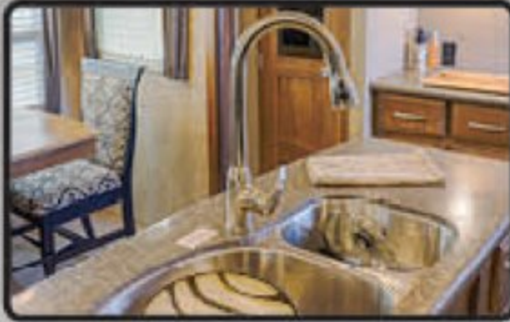
70/30 SINK W/PULL OUT FAUCET W/SOLID SURFACE SINK COVERS