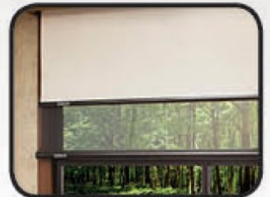
UPGRADE DAY/NIGHT ROLLER SHADES