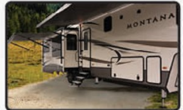
2ND PATIO AWNING W/LED LIGHT STRIP (SELECT MODELS)