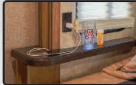
WRAP AROUND HARDWOOD NIGHT STANDS W/OUTLETS AND CUBBY STORAGE