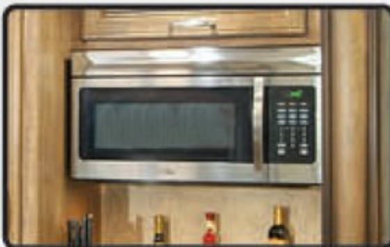
30" RESIDENTIAL CONVECTION MICROWAVE