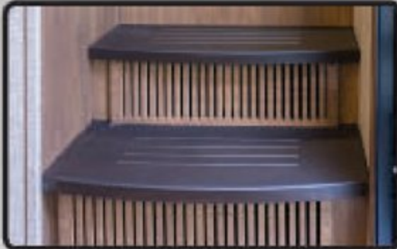
HARD SURFACE INTERIOR STEPS