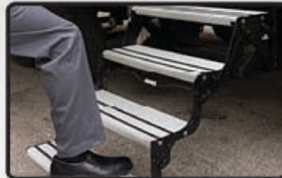
FOUR STEP ALUMINUM STEP TREADS FOR CONVENIENCE/COMFORT