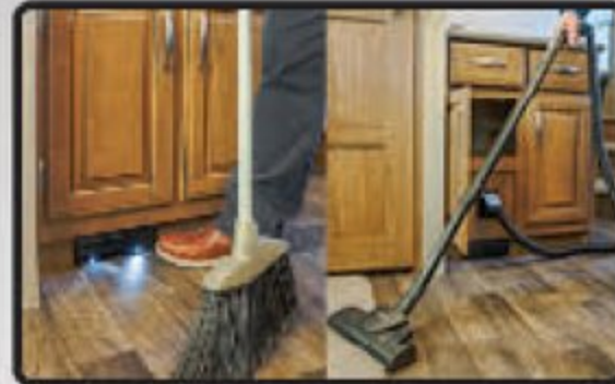
CENTRAL VACUUM W/KITCHEN TOE KICK W/ BOTH INTERIOR & EXTERIOR HOSE PORTS