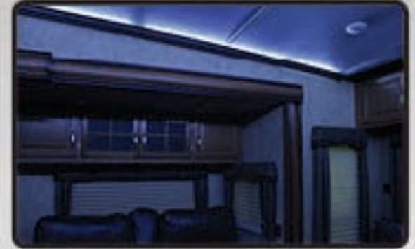
BACK-LIT CROWN MOLDING AMBIENT CEILING LIGHT