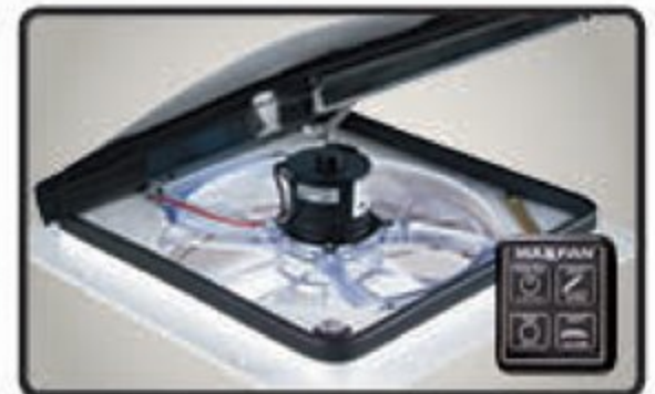
KITCHEN POWER RAIN SENSOR VENT FAN W/MULTI-SPEED WALL CONTROL