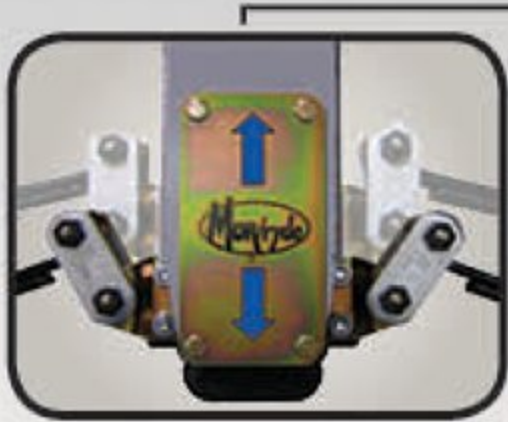
EXCLUSIVE MOR/RyDE 4100 SUSPENSION SYSTEM W/ WET BOLTS