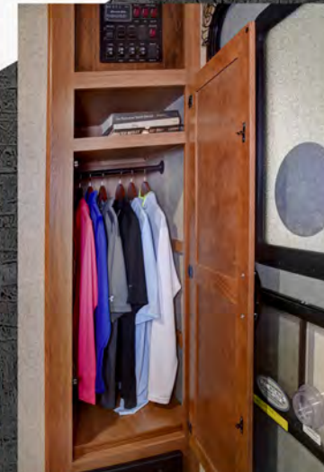
320BH Entryway storage used as closet space

*All Pantries include a hanging rod and adjustable shelving.