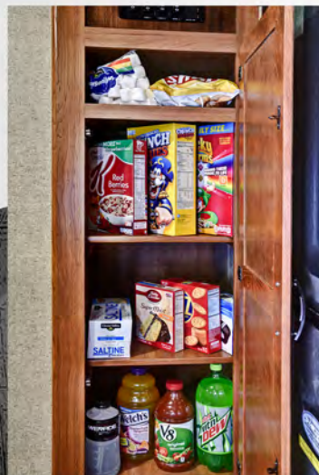
320BH Entryway Storage used as pantry