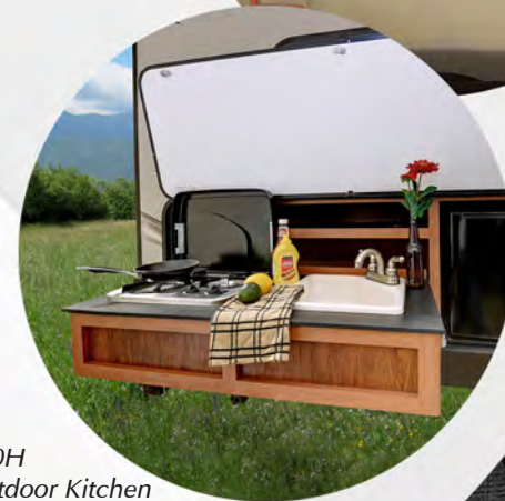
270H Outdoor Kitchen