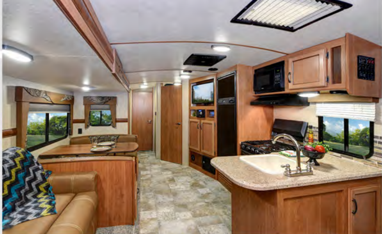
260RL Kitchen and Dinette Booth