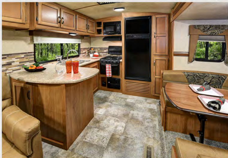
300RK Kitchen & Dinette Booth