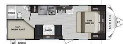
KODIAK ULTRA-LITE 227BH Length: 26' 11" Weight: 4,283lbs Sleeps: 7-8 Hitch: 497 lbs. Height: 10'3"