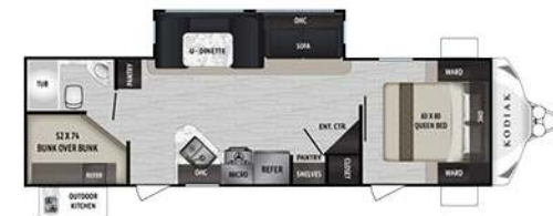
KODIAK ULTRA-LITE 289BHSL Length: 32' 11" Weight: 5,773lbs Sleeps: 7-10 Hitch: 656 lbs. Height: 10'9"