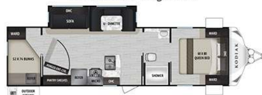
KODIAK ULTRA-LITE 296BHSL Length: 33' 11" Weight: 6,000lbs Sleeps: 6-8 Hitch: 630 lbs. Height: 10'9"