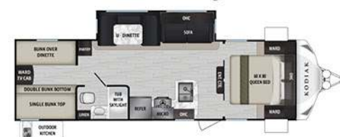
KODIAK ULTRA-LITE 283BHSL Length: 32' 10" Weight: 5,603lbs Sleeps: 8-10 Hitch: 756 lbs. Height: 10'7"