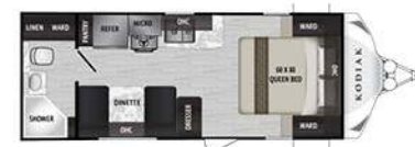
KODIAK ULTRA-LITE 201QB Length: 24' 1" Weight: 3,980lbs Sleeps: 3-4 Hitch: 452 lbs. Height: 10'3"