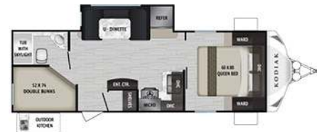
KODIAK ULTRA-LITE 248BHSL Length: 28' 11" Weight: 5,298lbs Sleeps: 6-8 Hitch: 584 lbs. Height: 10'7"