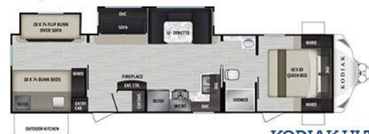
KODIAK ULTRA-LITE 332BHSL Length: 37' 3" Weight: 6,991lbs Sleeps: 8-10 Hitch: 907 lbs. Height: 11'2"