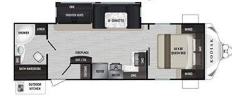
KODIAK ULTRA-LITE 261RBSL Length: 31' 0" Weight: 5,700lbs Sleeps: 3-4 Hitch: 636 lbs. Height: 10'7"