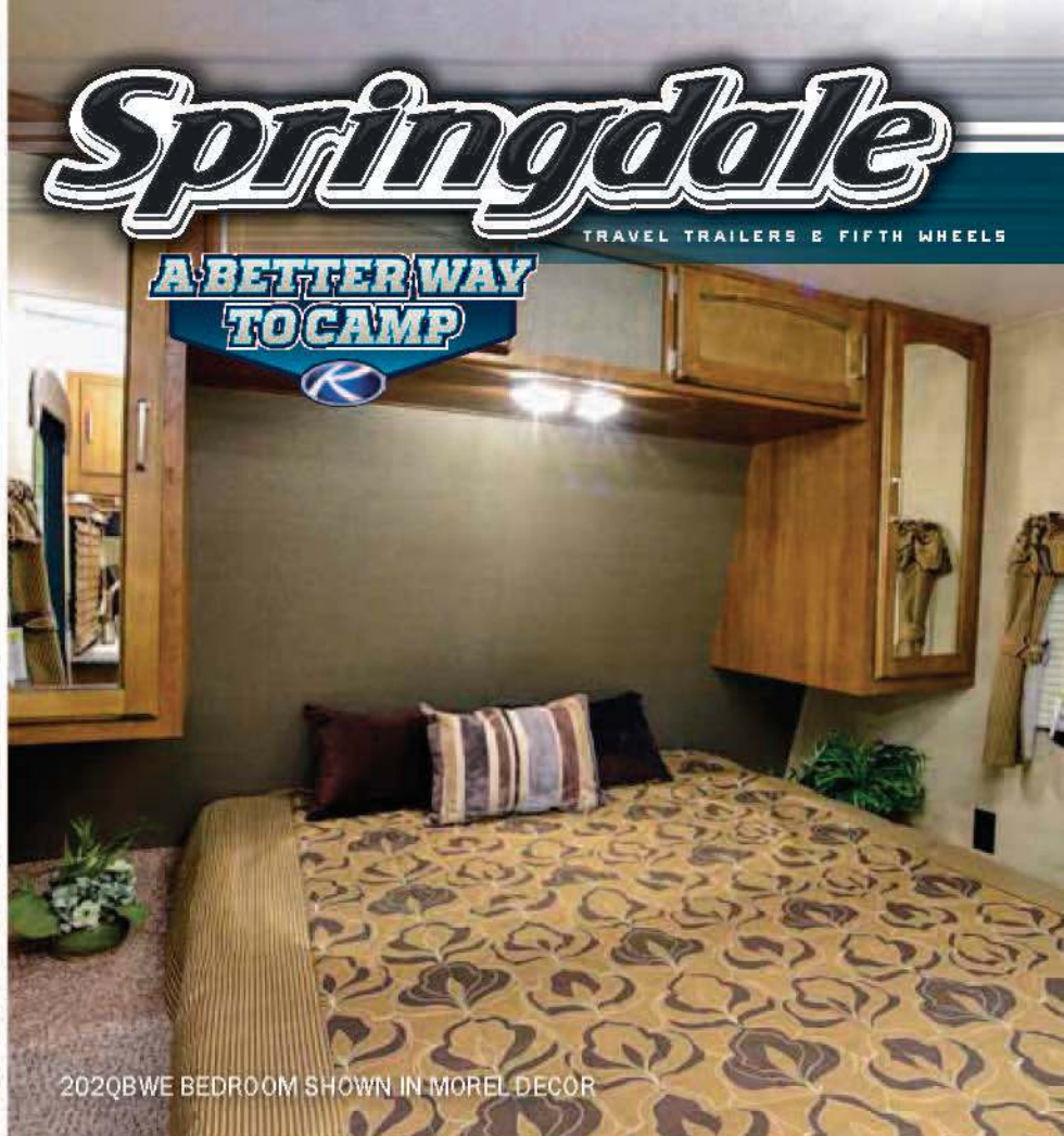
202QBWE BEDROOM SHOWN IN MOREL DECOR