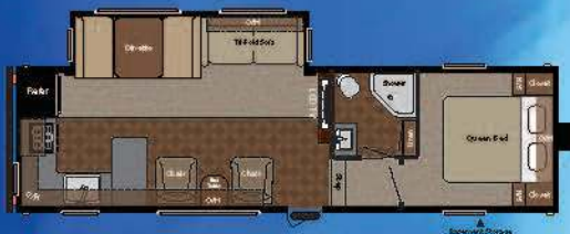
WEIGHT: 7291 LENGTH: 31' 11" • 280FWRK