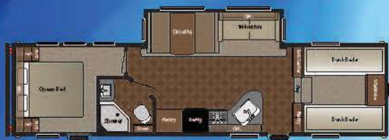
WEIGHT: 7842 LENGTH: 34' 5" • 320FWFB