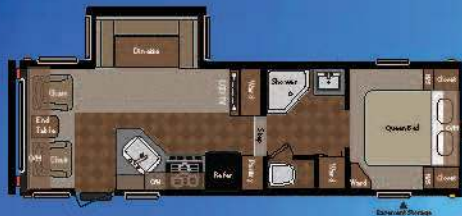
WEIGHT: 6439 LENGTH: 27' 8" • 247FWRL