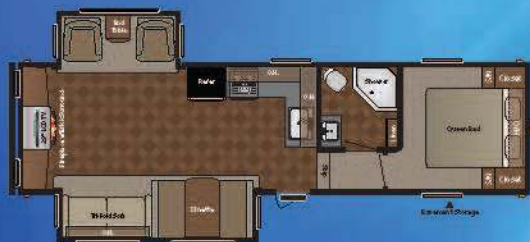
WEIGHT: 8065 LENGTH: 31' 11" • 253FWRE