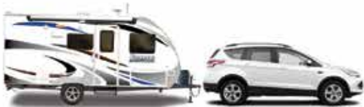
Model: 1475, 1575