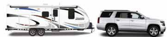
Models: 1475, 1575, 1685, 1985, 1995, 2155, 2185, 2285, 2295