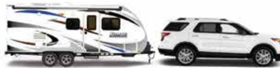
Models: 1475, 1575, 1685, 1985, 1995