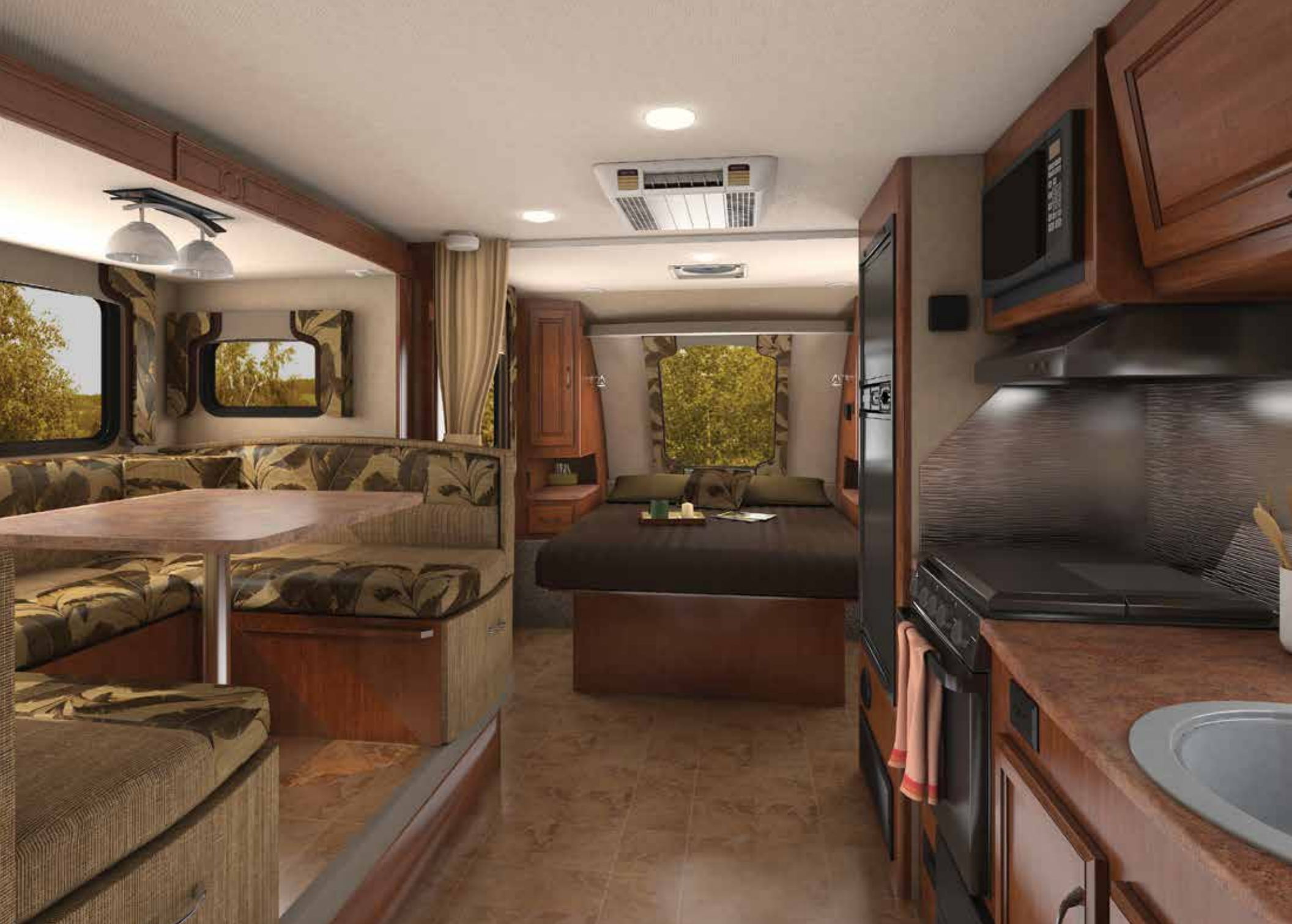
Model 1995 shown in Palm Springs