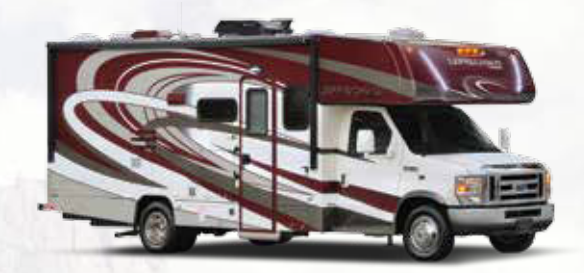
Merlot Full Body Paint (optional)