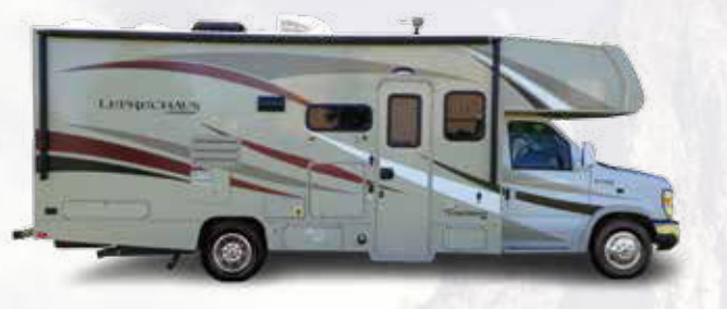
Color-infused Camel Fiberglass (Standard)